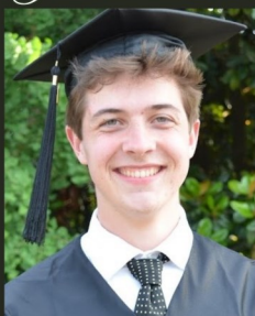
W Bachelor of Science Majoring in Finance