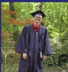
Dorman High School